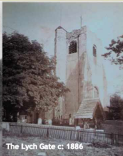
The Lych Gate c: 1886