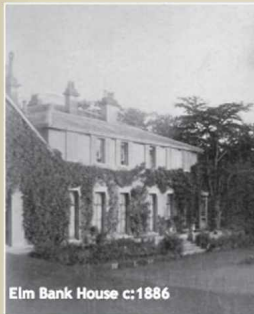
Elm Bank House c:1886